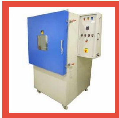
Dry Heat Chambers