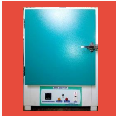
Electric Laboratory Hot Air Oven