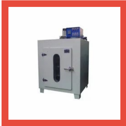
Curing Oven Machine