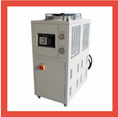
Portable Industrial Water Chiller