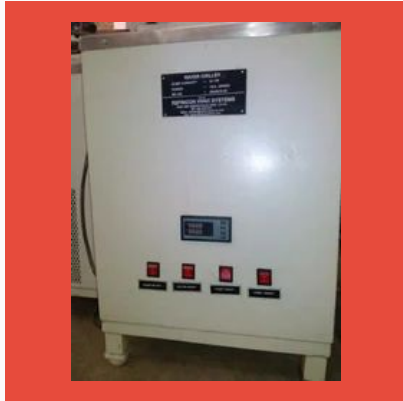
Lab Water Chiller