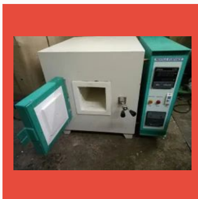
High Temperature Muffle Furnace