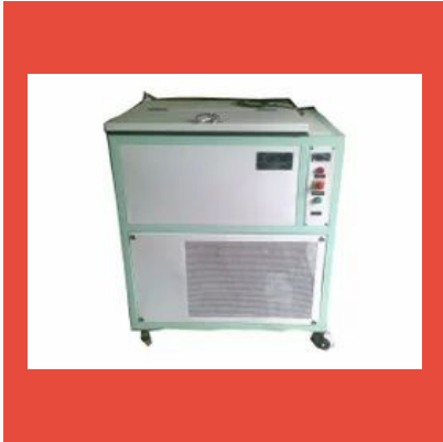
Process Water Chiller