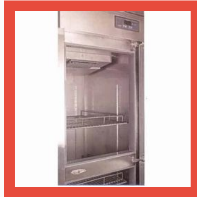
Ultra Low Temperature Freezer