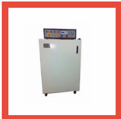
Laboratory Hot Air Oven