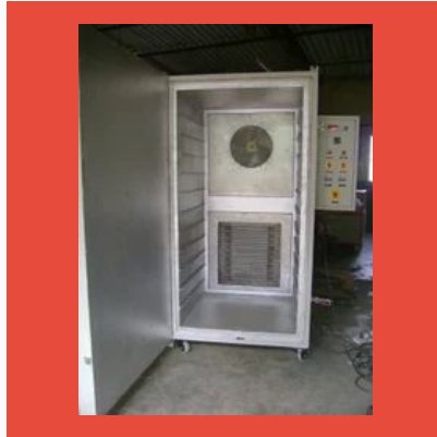
Industrial Batch Ovens