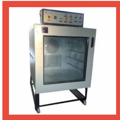
Burn In Chambers