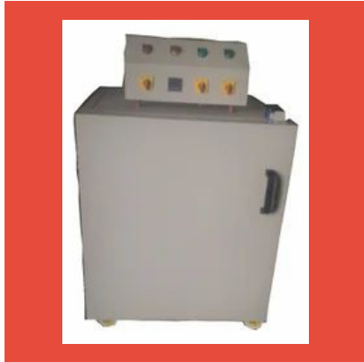
Hot Air Oven