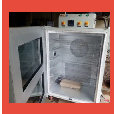
PCB Curing Oven