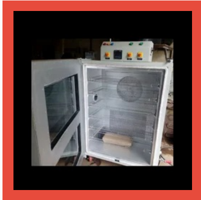
Industrial Heating Oven