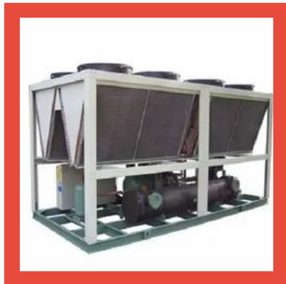
Air Cooled Chillers