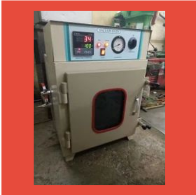
Digital Vacuum Oven