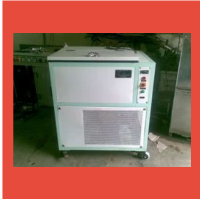
Portable Water Chiller