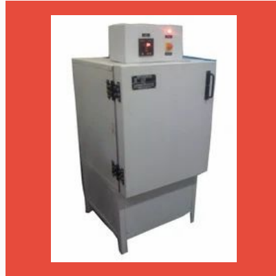
Drying Hot Air Oven