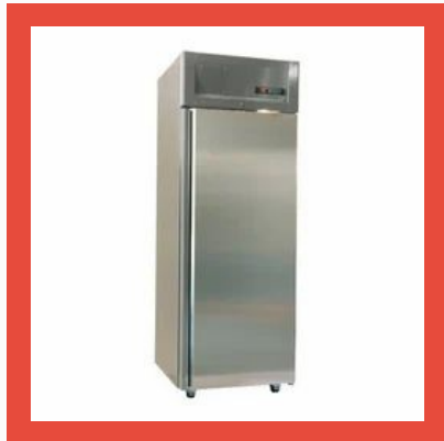
Vertical Low Temperature Freezer